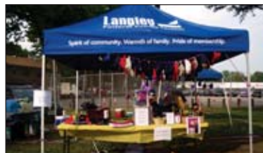
LFCU's tent at the Relay for Life rally.