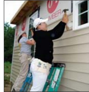
LPGA golfer Jiyai Shin (R) hammers vinyl siding on the Habitat House.

So, grab your tool belt and come on out to help LFCU build a Habitat House!